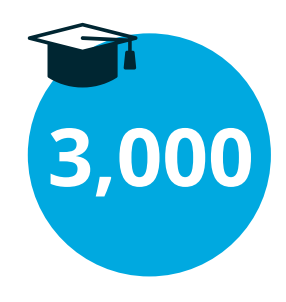
Learners in the First Year